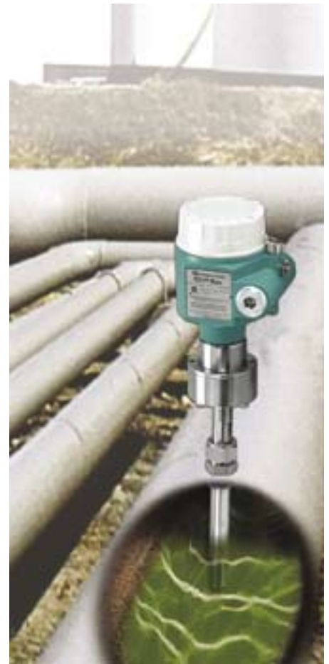
On the left: in power plants corrosion may have different causes. On the right: CorrTran MV is a 2 wires 4...20 mA transmitter with integrated HART protocol and built-in functionality to detect general and localized corrosion.

In order to protect the capital investment of the power plant, effective chemical-physical treatment of the feeding water is absolutely necessary, especially during maintenance work at the boiler and condensing systems. Poor quality of the water fed into the boiler may lead to severe problems, such as tending, pitting or corrosion of the components inside the boiler and condensing systems. The danger of corrosion can be limited by means of adding special chemical additives to the purified feeding water. Most plant operators measure the water quality by means of conductivity sensors and/or pH probes. However, while such measurements are suitable to sufficiently analyse the water quality, they provide no information as to the condition of the piping of the condensing systems.