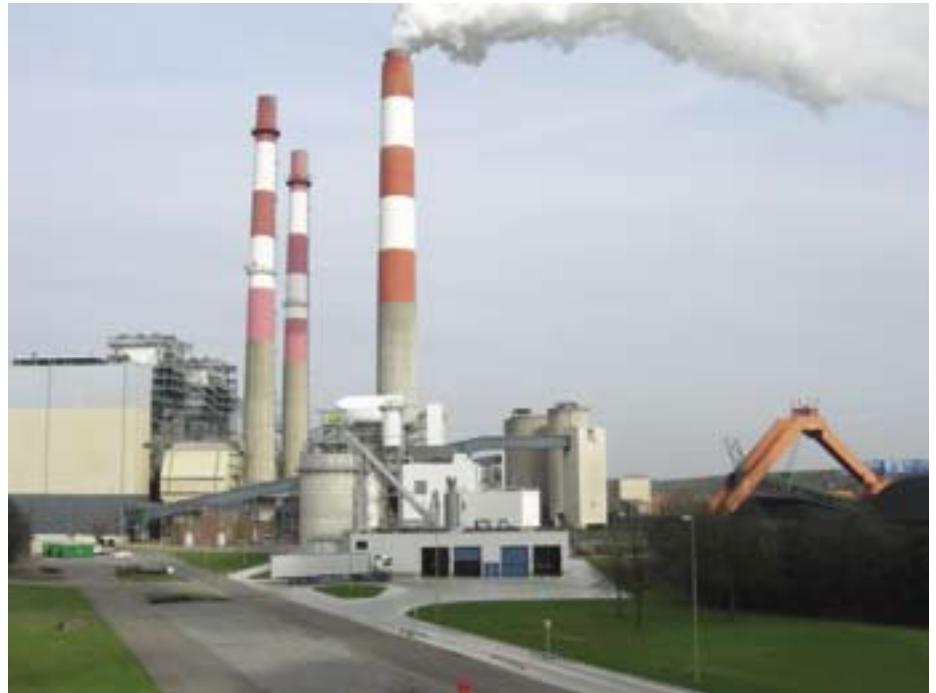
In power plants pure water has corrosive effects when it gets in contact with the steam generator and the condensing system. This may lead to severe problems, such as tinding, pitting or corrosion.

This continuous flow of purified water is fed into the steam generator which produces the steam that drives the turbine used to generate electricity. Part of the steam is used to preheat the pure water before it enters the steam generator. After passing through the generator, the steam turns into condensate, which is then collected and fed back into the cycle together with newly purified