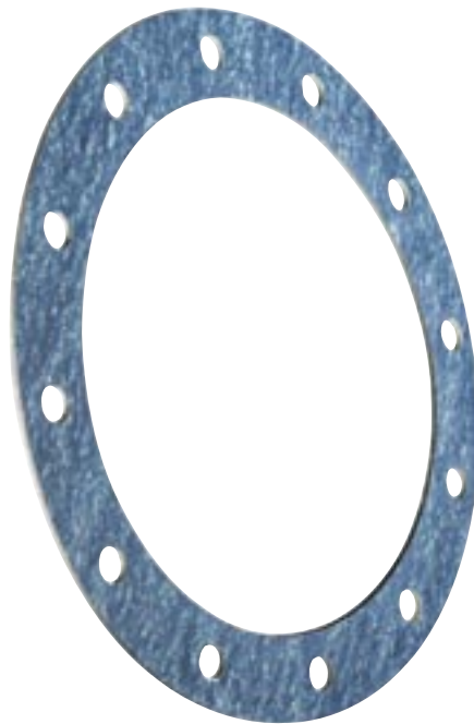
Figure 1: this compressed fiber gasket contains a proprietary rubber binder, allowing it to swell and create a compressive load in both oil and water service.

Fluid sealing devices come in many different materials and configurations, primarily as gaskets for flanged joints and compression packing for pumps and valves. The process of selecting the right device for any given application begins with defining the expected level of performance and identifying service conditions. Ultimately, whatever sealing solution is selected must be able to withstand the service conditions to which it will be exposed and, ideally, remain maintenance-free over the course of its anticipated useful life. To eliminate unscheduled outages, it is important to make sure the service life of the sealing device corresponds to the maintenance cycle. Sealing devices also should be cost-effective, capable of saving more than they cost within budgetary constraints. Another important selection criterion may be compliance with regulations and standards. Most sealing manufacturers can provide certificates of conformance for their products, but compliance with standards often calls for documentation of performance based on regulated test and measurement methods. In addition, sealing devices often serve to protect equipment and components, minimizing the need for replacement parts. In many applications, particularly refineries, they also must be fire-safe. This means that during a fire the seal will maintain its integrity and not further fuel the fire. In the absence of a universal sealing solution, consolidating