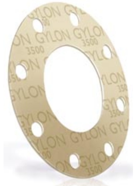
Figure 2: PTFE gaskets are used extensively in the chemical processing, food and beverage and pharmaceutical industries.

different sealing devices to the fewest number can minimize stocking and inventory requirements. Fortunately, most fluid sealing applications do not involve all of these requirements. However, they serve as a useful starting point in formulating your sealing material selection strategy. Taking that strategy to the next level is done by establishing the operating parameters of the service for which the sealing solution is intended.