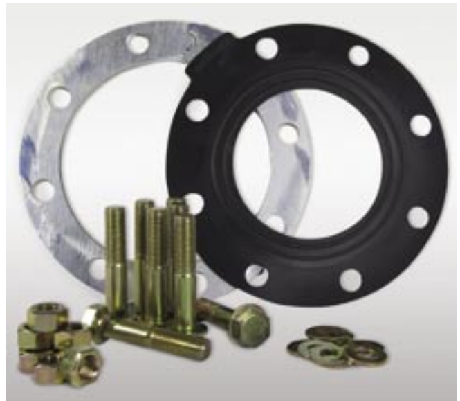
Figure 3: compression packing sets incorporate a combination of carbon, graphite, spacers and flexible graphite braid. They expand radially when the gland is tightened for a positive seal on both the valve stem O.D. and stuffing box I.D.

multiple options also allows you to take into account other factors, such as availability and price. In today's environment of heightened cost-consciousness, price too often trumps quality and performance. Selection of the best sealing solution for a particular application should be governed by the application itself. Price should become secondary, for example, in applications requiring standard or regulatory compliance. When assessing the difference between a high- and low-cost solution, be sure to consider the expense of raw materials used in the seal, life expectancy, reliability, ease of installation and removal, and potential cost of failure. Cost of failure can be assessed in such terms as lost production, labor to repair or replace the failed seal, worker safety and consequences of not complying with environmental regulations.